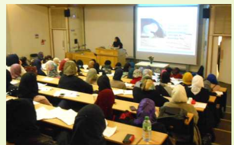
A view of seminar