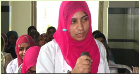
The medical students expressed their sentiments and pledged to be a part of such camps in future as well.