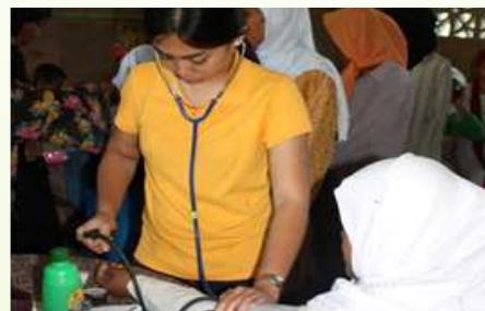
A medic examining the patients.