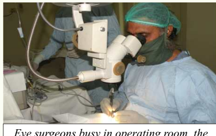
Eye surgeons busy in operating room, the latest phacoemulsification units were used.