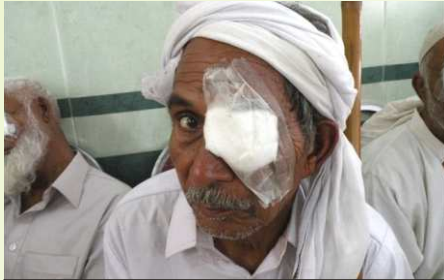
Patients after surgery, satisfied and smiling.