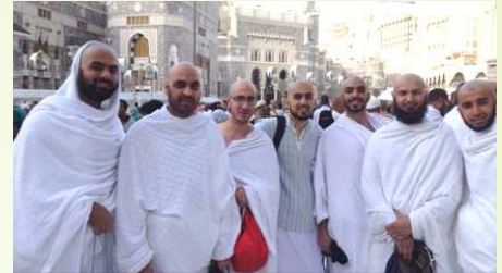
The medical students after performing Umrah outside the holy Mosque in Makkah