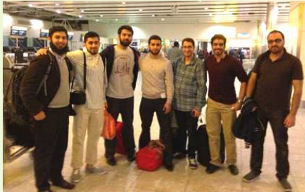
BIMA youth leaving for Umrah Camp.

activities includes Dawah training, CME, students activities, sister's circle, publications, scientific meetings and annual convention.