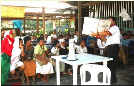
Dental Hygiene camp, the trainer is teaching school children importance of dental health.

calamities, outreach programs, education and research discussion, and to disseminate medical information through cooperation and coordination with other organizations.