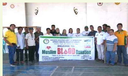
Periodic blood donation camps are conducted to help the patients requiring emergency and bleeding disorders.