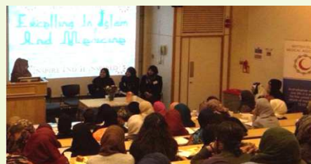
BIMA sisters wing arranged a seminar on "Inspire and be Inspired" to celebrate Muslim women in Medicine.