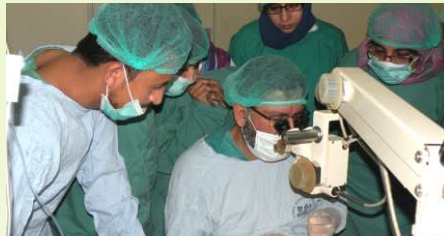
The students were shown live operative procedures.