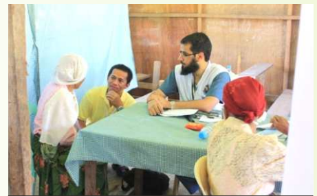
Medical relief camp, following devastation of Typhoon .