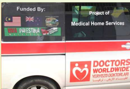
Medical home services in Gaza received two ambulances from VP Malaysia.