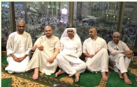
During leisure hour waiting for the dinner.