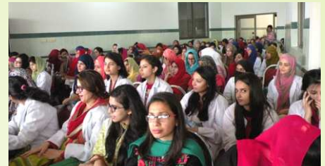
A large number of medical students/volunteers attended the camp.