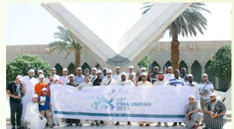
A group photo of the participants of 10th FIMA Umrah Camp.