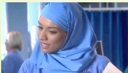
The sisters in BIMA are actively engaged in CME and faith based learning.