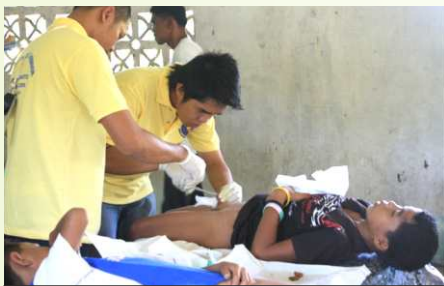
Circumcision camp is also conducted periodically.