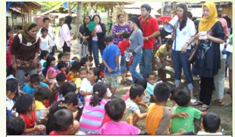
Dental Missions - Tooth brushing and Fluoride Application for children in communities and schools