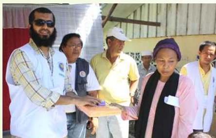
Relief items and goods were distributed in the relief camp. (Typhoon wash)