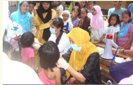
Scaling and cleansing was also carried out during the camp.