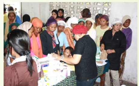
Well stocked Dispensary where delivery of free medicine was made.