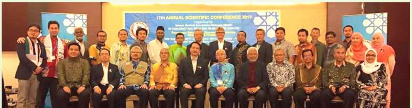
The office bearers and organizers of 17th IMAM National conference