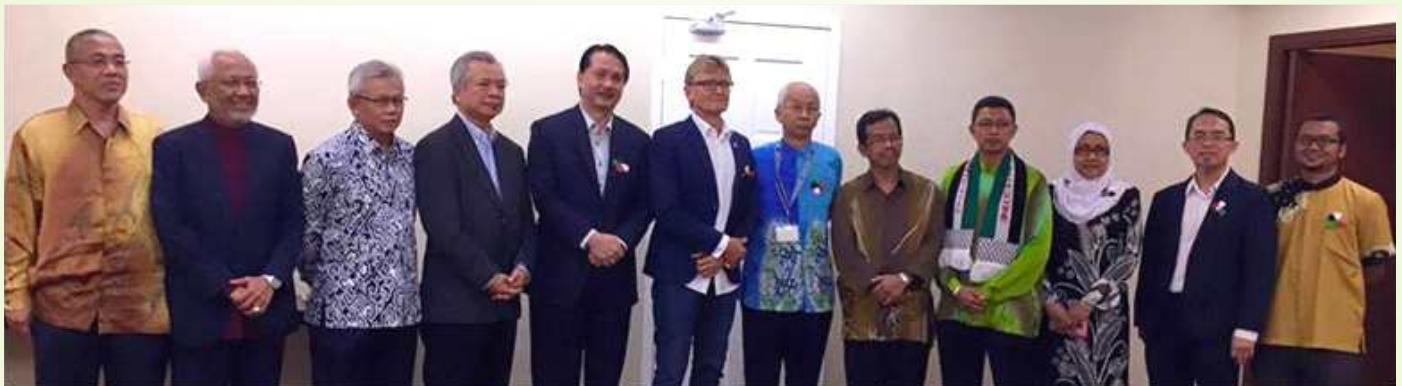
THE IMAM leadership with guests of honor.