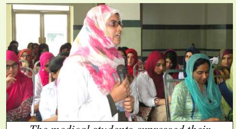
The medical students expressed their sentiments and pledged to be a part of such camps in future as well.