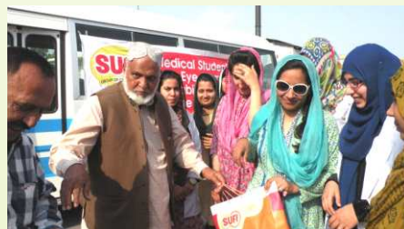
The students receiving their souvenirs.