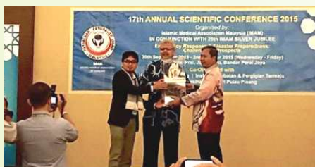
The cyclist gloves sold for RM 10001 & the money goes to Palestinian medical relief