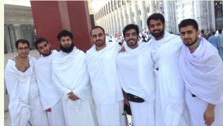
The medical students after performing Umrah in the holy Mosque in Makkah