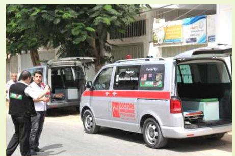
The ambulances are fully equipped and are functional since last 2 months.