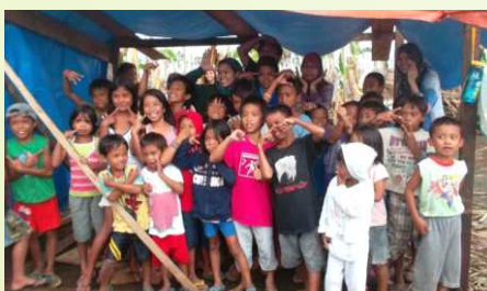
Psychosocial Support for Children victims of disasters (Typhoon Washi, and Bopha) and Armed-Conflict evacuation camps