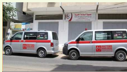
Doctors worldwide Turkey is running a project of home medical service, where old and patients with special needs are provided medical and healthcare facility.