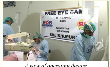
A view of operating theatre at Habib welfare hospital

Group of industries. Our journey started from in front of our college, where three buses in tip top condition were parked on time. We all got seated comfortably, the buses departed on 8:00 am and after passing through different areas of Lahore and crossing river Ravi, we arrived at POB Trust.