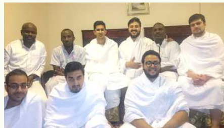
BIMA medical students with friends from various countries.